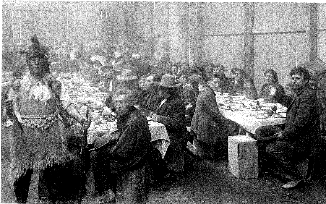
Tulalip Treaty Days 1914 - Tribal Long House