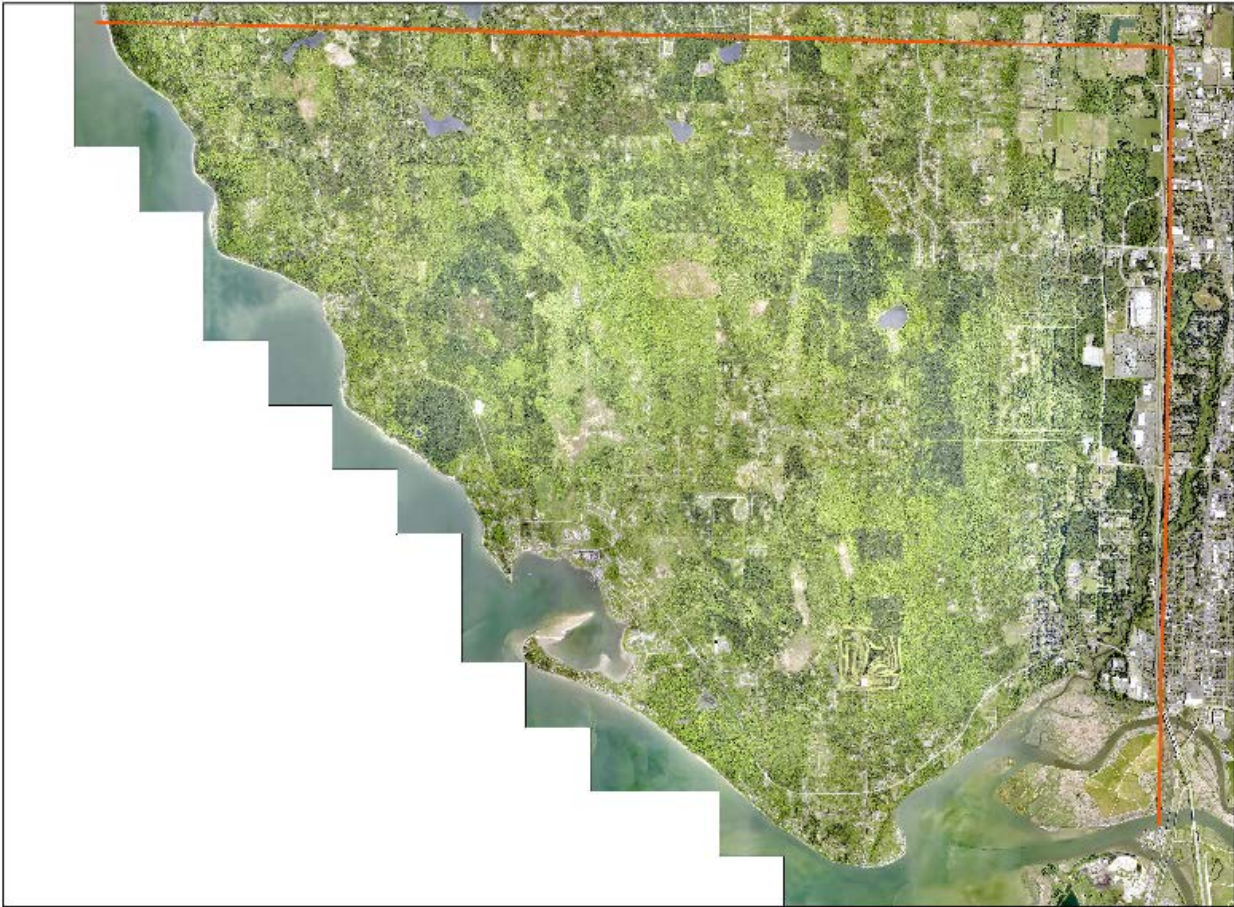
Tulalip Tribes of WA. Reservation