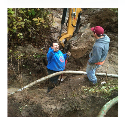
"It is our goal to Provide adequate safe drinking water for everyone in our community."

Our tribal employees enjoying their work day locating and repairing a broken water line.