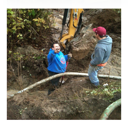
"It is our goal to Provide adequate safe drinking water for everyone in our community."

Our tribal employees enjoying their work day locating and repairing a broken water line.